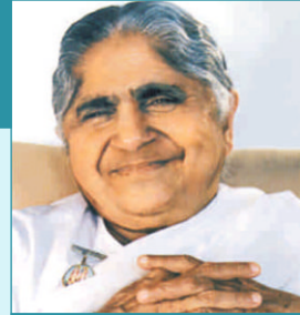
Dadi Janki ji Chief of Brahma Kumaris

Life and God has bestowed us great powers, which we need to use constantly, not just one but all of them. The highest power is the power to transform the self. I understand that every life's situation gives me an opportunity to change. So, let there be this dedication for self-transformation. Let me not think, this person should change or that situation should change.