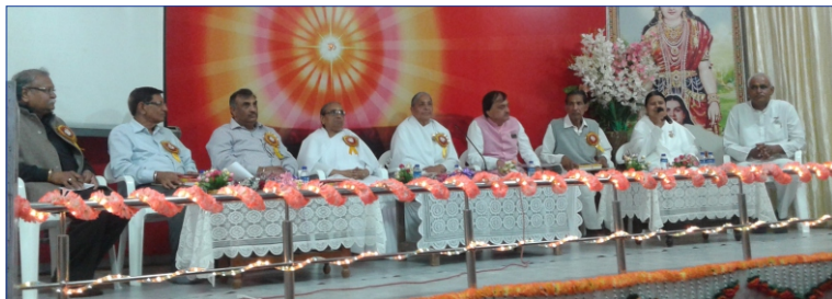
Service at Bawana.