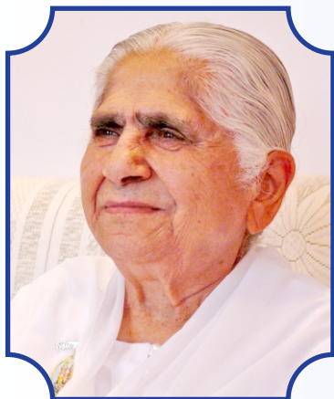
Dadi Janki ji Chief of Brahma Kumaris

It is a fact that we can only change ourselves by first changing our thoughts. If there is constant battling in our minds, then what will happen when we come into speech and action? We need to understand clearly where waste thoughts lead us, and also understand that battling is a huge waste of time. When our thoughts are like webs, they trap us, then like a spider that creates one web and then moves on and creates another, our own thoughts become our enemies. There is then enmity and animosity with others. Now let us take a thought to change that. Let us understand that we have a treasure-store of knowledge and a treasure-store of thoughts. Not just ordinary thoughts but a treasure-store of pure and peaceful thoughts.