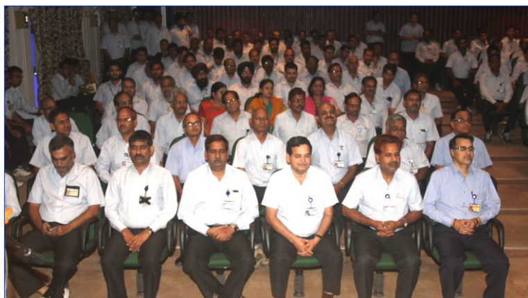
Program at Atomic power plant in Rawatbhata.