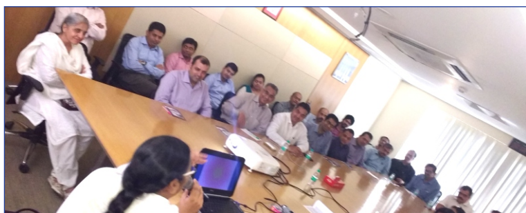
Meditation course for staff of Ultra Tech Cement. 30 attended the session conducted by Sis. BK Jagruti.