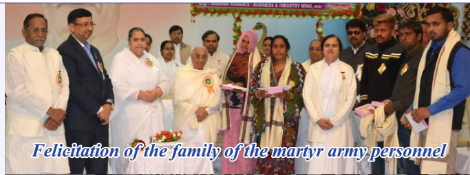
Felicitation of the family of the martyr army personnel

A felicitation ceremony was held for the family of the martyrs who lost their lives in the shooting at Kupwada in Jammu & Kashmir. A cheque was also presented to the family.